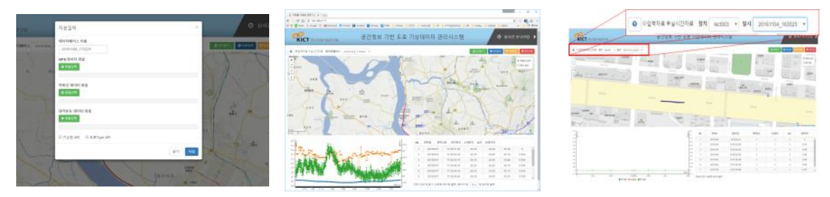
(a)Data upload (b)Data display (c)Check the detailed information Figure 2. Composition of road surface temperature display using the web

The data management (upload and monitoring) acquired in the acquisition system of road data is performedby the following method. GPS data, infrared data, ambient temperature data files are uploaded using the [data input] button in the upper right side in the data management screen, and once data from the Korea Meteorological Administration (KMA) and road type API are selected, corresponding data upload can be done. Once the upload of the file is complete, location information of the data and sensor information can be checked. Furthermore, the selected real-time storage data can be checked through the real-time data check function. The condition of the device can be classified into READY (state that the device is connected), RUNNING (state that the device is tracking), and DISCONNECT (state that the device is disconnected). A system that stored data in the database was implemented while RUNNING operation state. Figure 2.shows the real-time monitoring function and screen of road weather data based on spatial information.